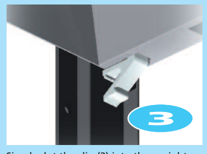
Simply slot the clip (2) into the uprights (3) to create an extremely rigid structure yet allowing for quick and easy re-positioning of shelves.