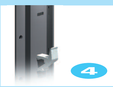
Shelves locate at 50mm increments (4) as standard for maximum versatility in shelf positioning.