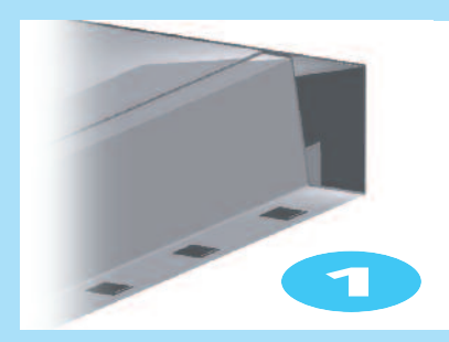
Shelves (1) utilise box section construction at the front and rear for load bearing strength and rigidity.

Euro Shelving is available open backed or clad to match your precise specifications. Units are supplied flat packed for immediate self assembly.